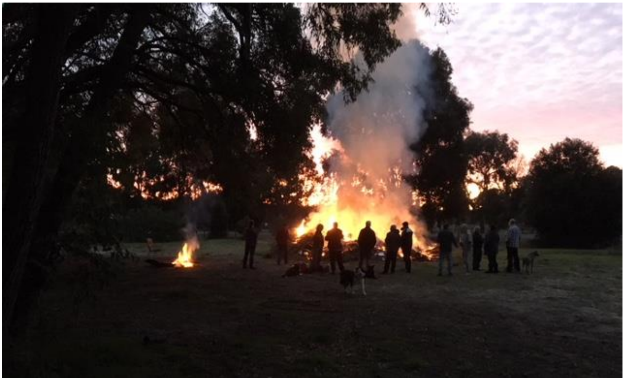
The BIG bonfire and the second cosy fire