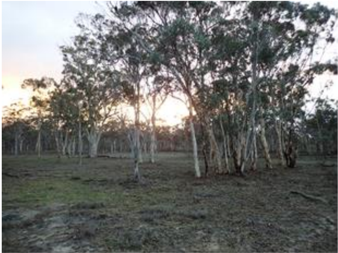
For the campovers, the next morning was lovely after a freezing and wet night