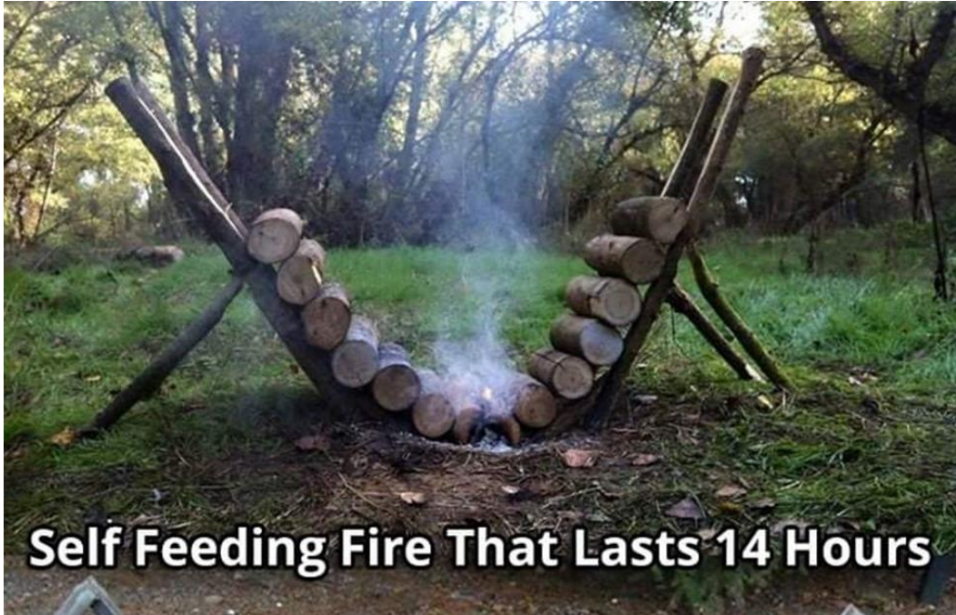
Self Feeding Fire That Lasts 14 Hours