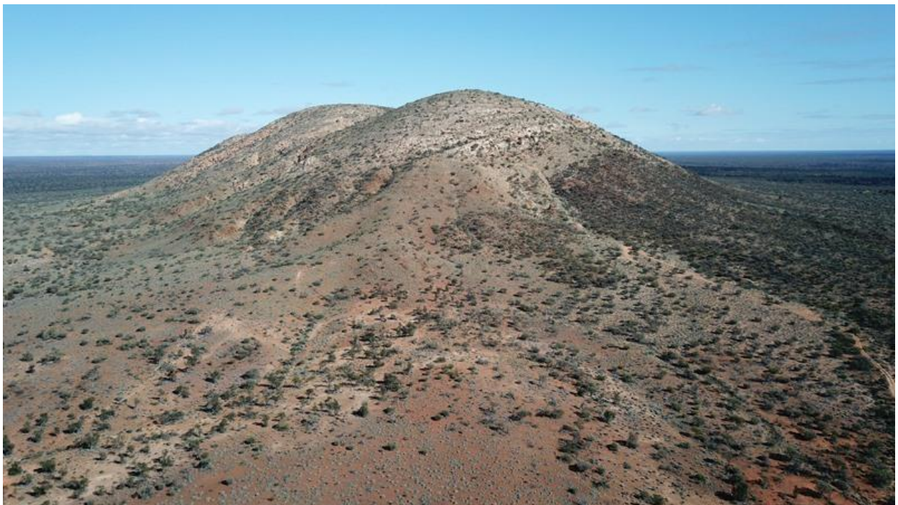
Mt Finke – Named after William Finke, who was associated with mining and pastoral activities.

20km from the campsite we found ourselves on the track leading to Mt Finke which was a 7 km deviation. Mt Finke is the only noticeable feature along the track at 275 metres above the surrounding landscape (369 metres ASL).