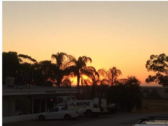
Sunset at Hotel California...no wait, Cataby Roadhouse