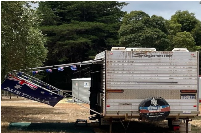
Our president’s caravan